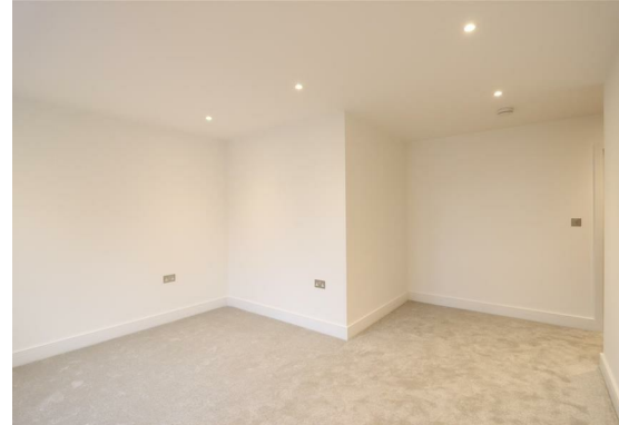
Bedroom 1 walk in wardrobe 5'8" x 7'3" (1.74 x 2.21)