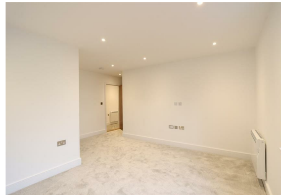
Bedroom 2 15'9" x 13'6" (4.82 x 4.12)